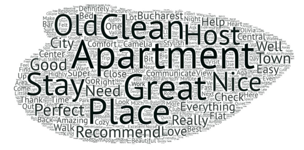
Figure 2. Word cloud